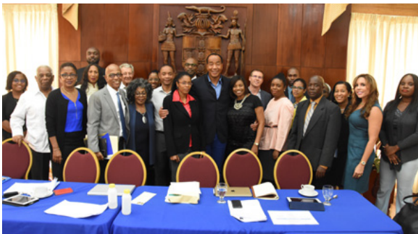
Representatives of The Financial Services Commission pose with members of the Economic Growth Council (EGC) following a consultative meeting at Jamaica House.